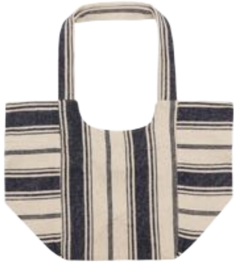
02094 Art Blue/Multi