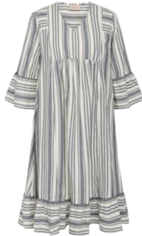
01431 Art Blue/White