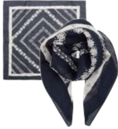
00772 Print Dark Blue