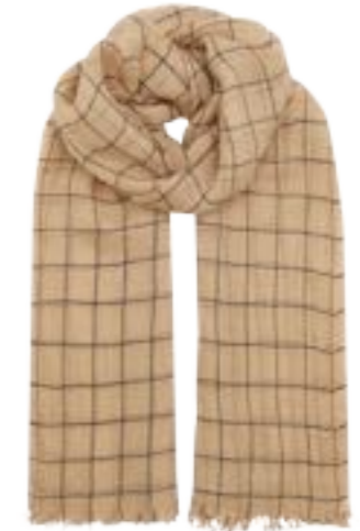
02072 Art Offwhite