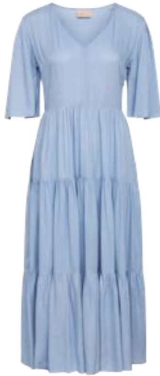
02061 Faded Denim