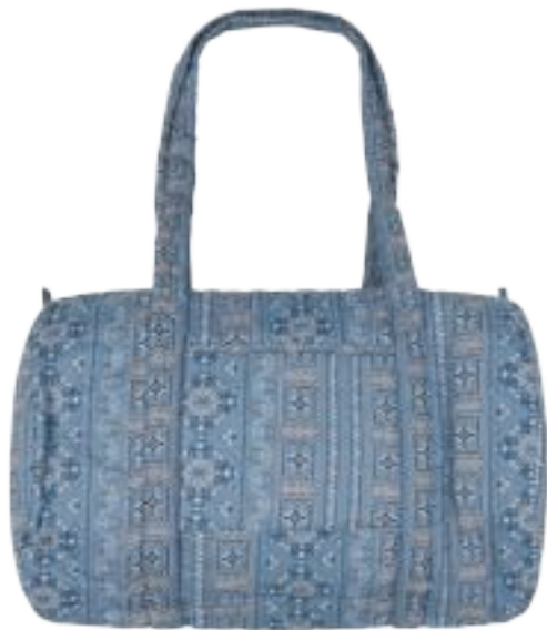
00464 Print Blue