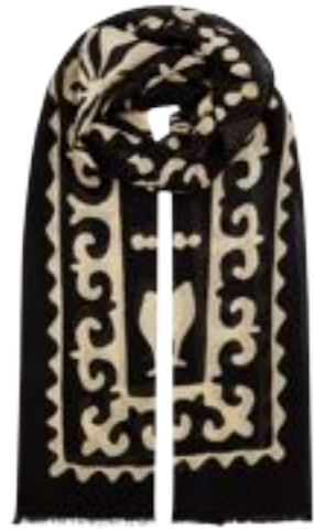
02160 Print Black/Creme