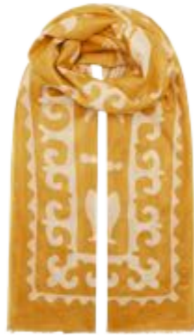
02161 Print Yellow/Creme