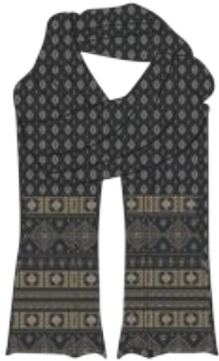
01831 Print Navy Blue