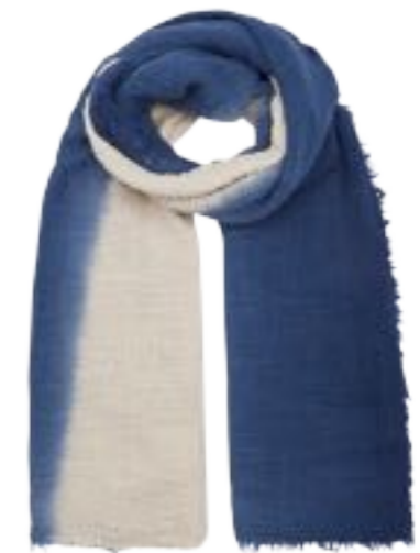
00477 Art Blue