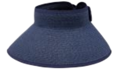
01413 Dark Blue