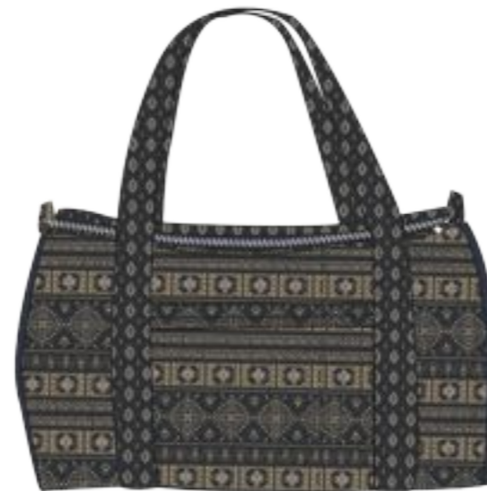
01831 Print Navy Blue