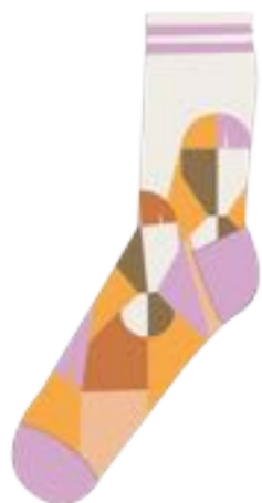
01340 Print Offwhite/Brown

JOSEFAUM SOCKS 6-50254-1 80% viscose, 17% polyamide, 3% elastane 36-38, 39-41