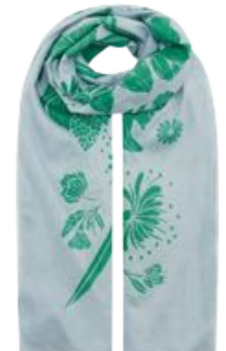
01404 Print Blue/Green