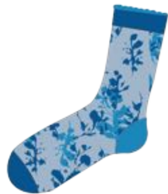
00477 Art Blue