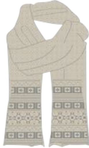
00550 Print Off White