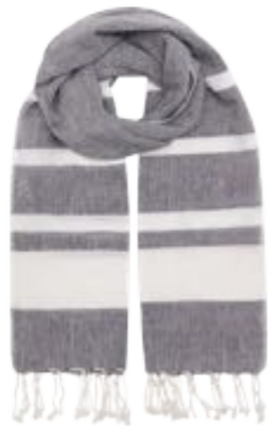
02090 Art Blue/Offwhite