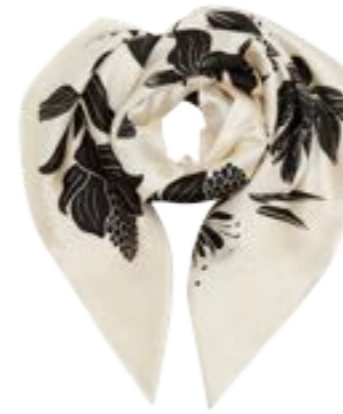
01341 Print Offwhite/Black