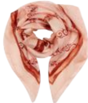
01521 Print Rose/Brown