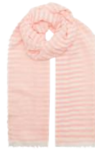
01846 Art White/Rose