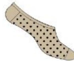
01275 Art Beige