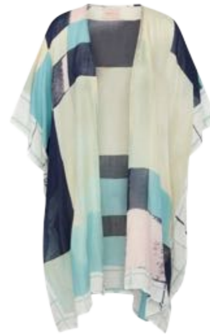
01391 Print Blue/Beige