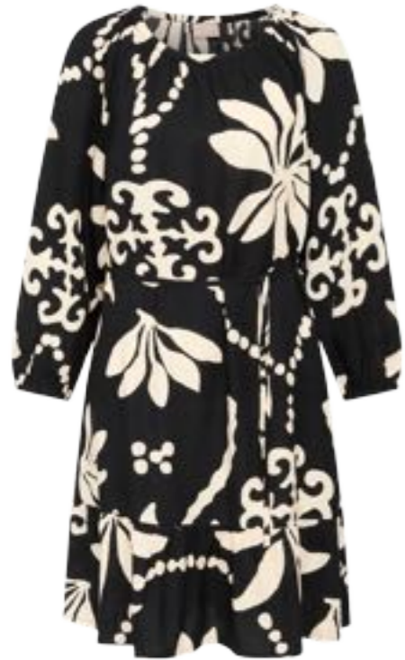
02160 Print Black/Creme