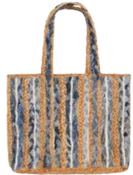
00477 Art Blue