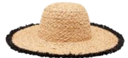
02118 Art Nature/Black