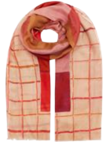
02113 Print Rose/Orange