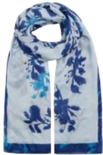
00464 Print Blue