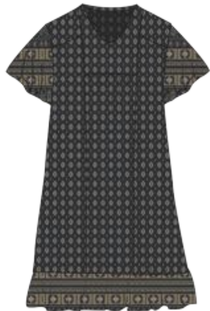
01831 Print Navy Blue