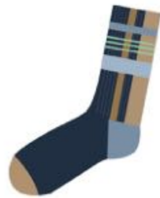
02144 Art Brown/ Dark Blue