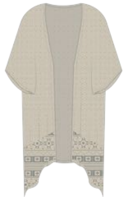
00550 Print Off White