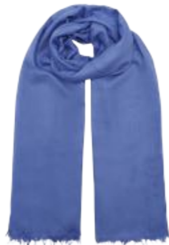
01413 Dark Blue