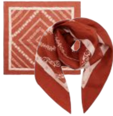
00474 Print Brown