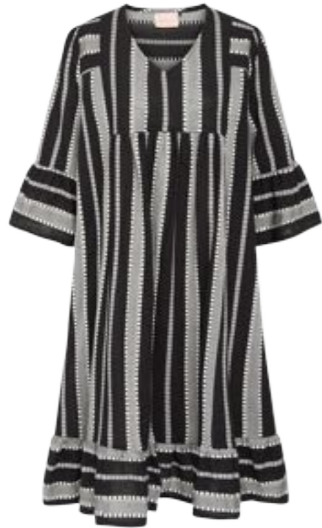
01988 Art Black/White