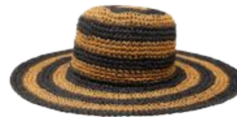
01355 Art Beige/Black