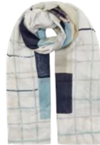
01391 Print Blue/Beige