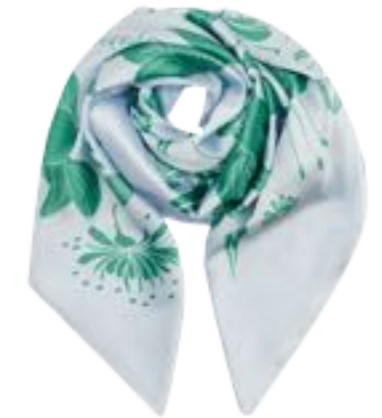
01404 Print Blue/Green