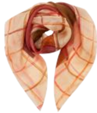
02113 Print Rose/Orange