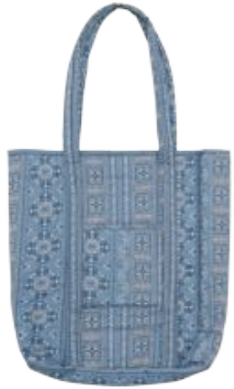
00464 Print Blue