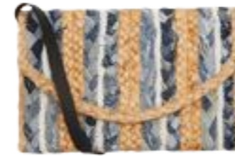
00477 Art Blue