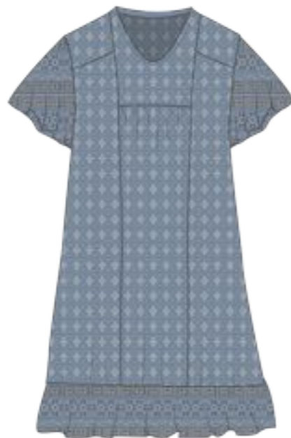
00464 Print Blue