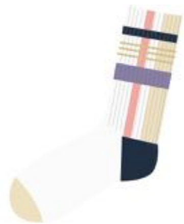
01765 Art Beige/White