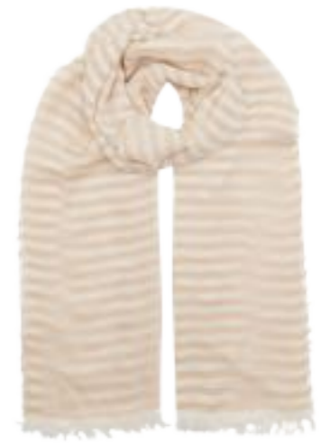
01845 Art White/Sand