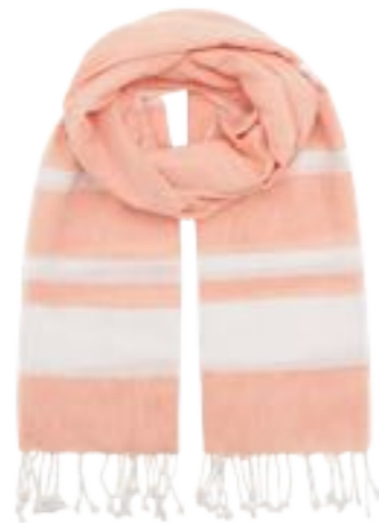
02091 Art Coral/Offwhite