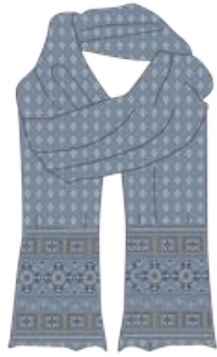
00464 Print Blue