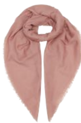
00842 Rose Dust