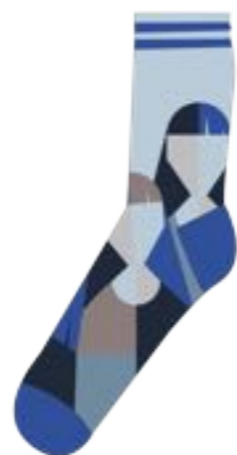
00464 Print Blue

DARLENEUM SOCKS 6-50253-1 78% cotton, 17% polyamide, 5% elastane 36-38, 39-41