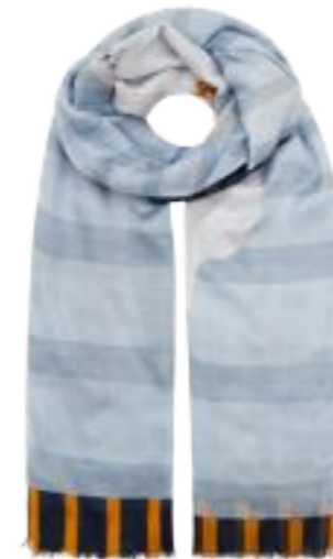
01404 Print Blue/Green