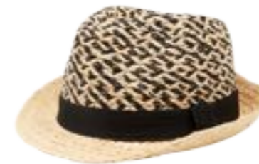
02118 Art Nature/Black

80% bamboo, 17% polyamide, 3% elastane 36-38, 39-41