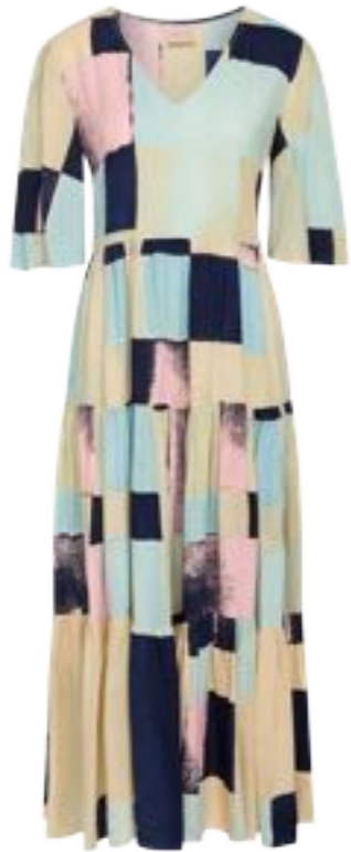
01391 Print Blue/Beige