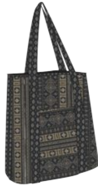
01831 Print Navy Blue