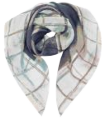
01391 Print Blue/Beige