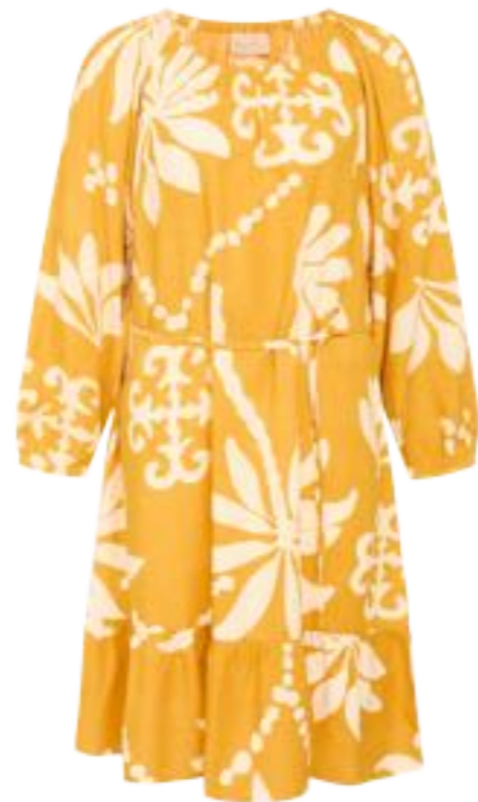
02161 Print Yellow/Creme