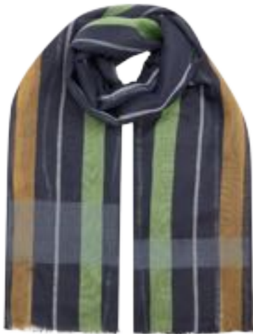
02094 Art Blue/Multi