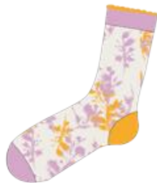
01857 Art Rose/Yellow

JOSEFAUM SOCKS 6-50254-1 80% viscose, 17% polyamide, 3% elastane 36-38, 39-41