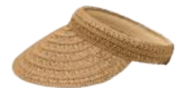
01799 Dark Sand