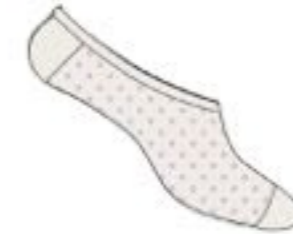
01846 Art White/Rose