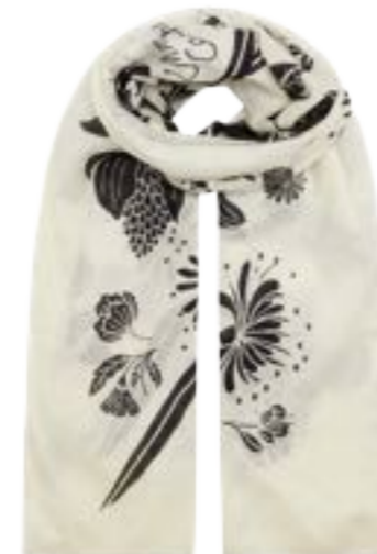
01341 Print Offwhite/Black