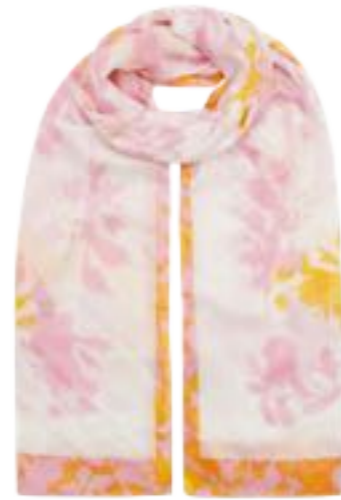
02111 Print Offwhite/Violet