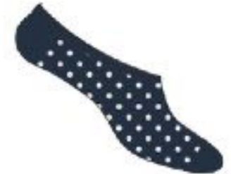
02145 Art Dark Blue