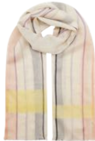
02095 Art Offwhite/Multi