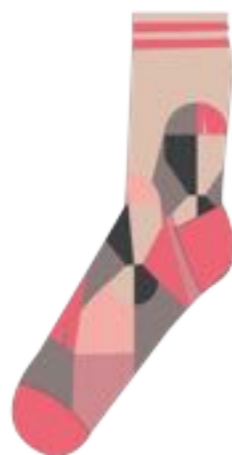
01394 Print Rose/Pink