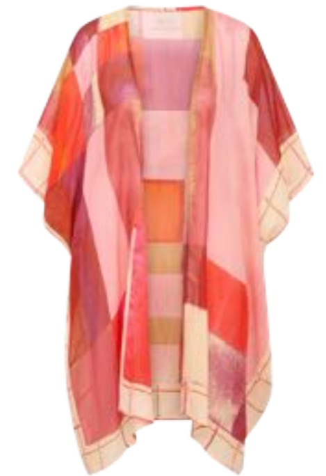
02113 Print Rose/Orange