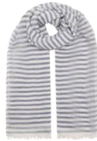
01431 Art Blue/White