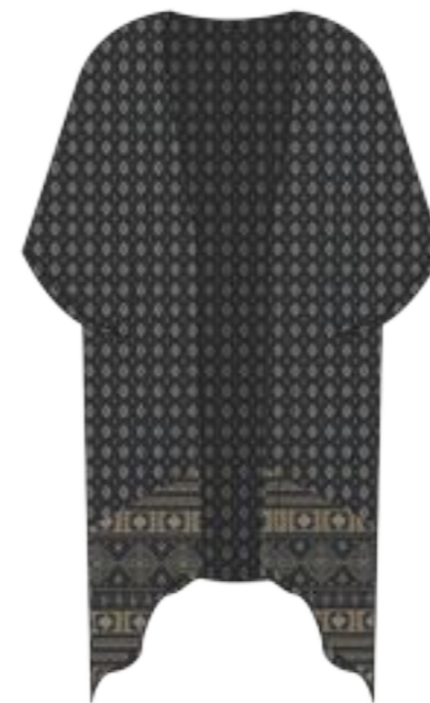
01831 Print Navy Blue