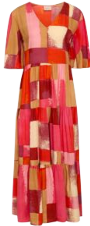
02113 Print Rose/Orange