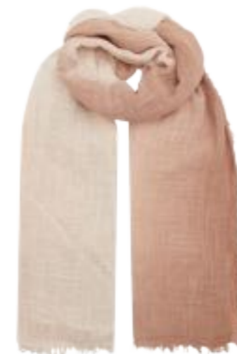
01275 Art Beige