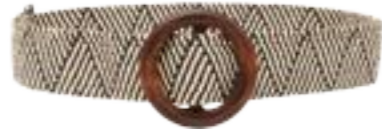
01988 Art Black/White