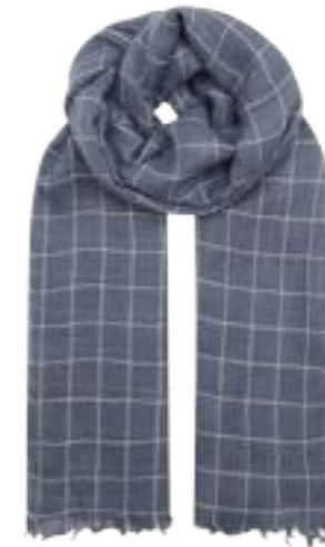
00477 Art Blue