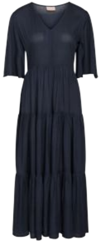
01902 Navy Blazer