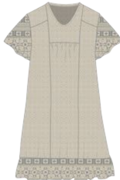
00550 Print Off White