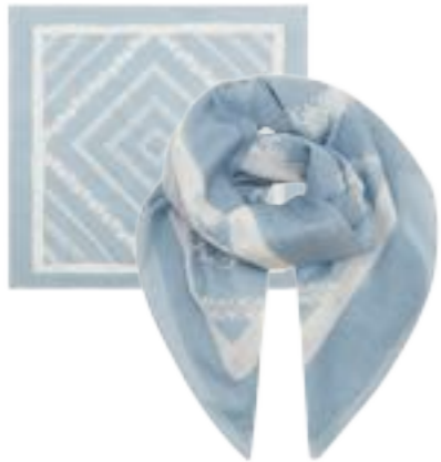
00770 Print Light Blue