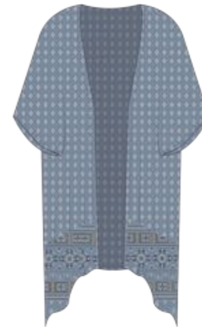
00464 Print Blue